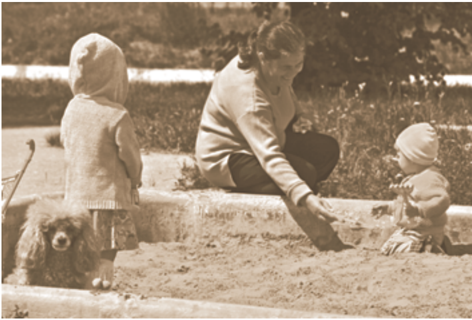
Predictable routines can support children's emerging self-control capacities.

forehead (see Glossary box). One of the biggest differences between human brains and monkey brains is the size of the prefrontal cortex, which is much larger in humans. It is involved in complex attentional and organizational skills, including following rules, reasoning, suppressing impulses, and making decisions (Casey et al., 1997). Neuroimaging studies show that the prefrontal cortex develops gradually from infancy through adolescence (Gogtay et al., 2004). The orbitofrontal cortex is located just behind the eyes and also is involved in decision making, especially when the decision involves reward, as in the example of waiting for candy (Zelazo, Carlson, & Kesek, 2008; see Figure 1, and see Glossary box).